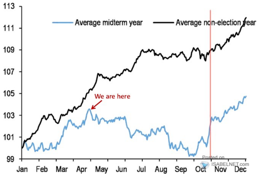
Average S&P500 level (indexed at 100 in Jan) for midterm and non-election years. Sample starts in 1946